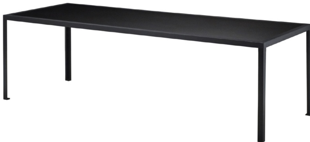
Table. Attention, new height 74 cm. Demountable steel frame 40 x 40 x 5 mm iron drawn angles, epoxy painted semiopaque black or white. Encased top in black linoleum or, new version, white FENIX NTM Nanotech Matt

200 x 90 x H 74 cm 240 x 90 x H 74 cm 280 x 120 x H 74 cm Return table: 80 x 50 x H 74 cm