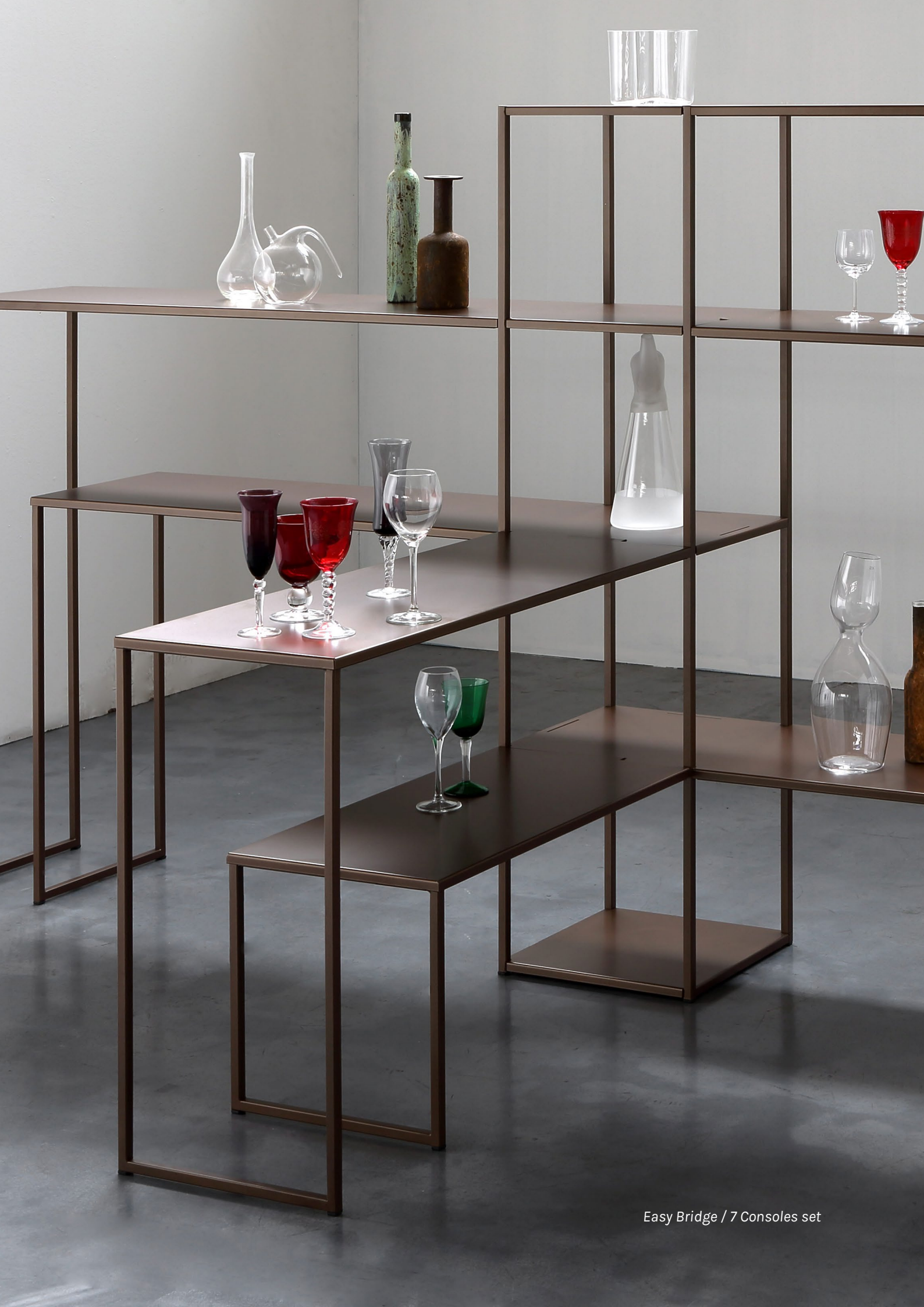
Easy Bridge / 7 Consoles set